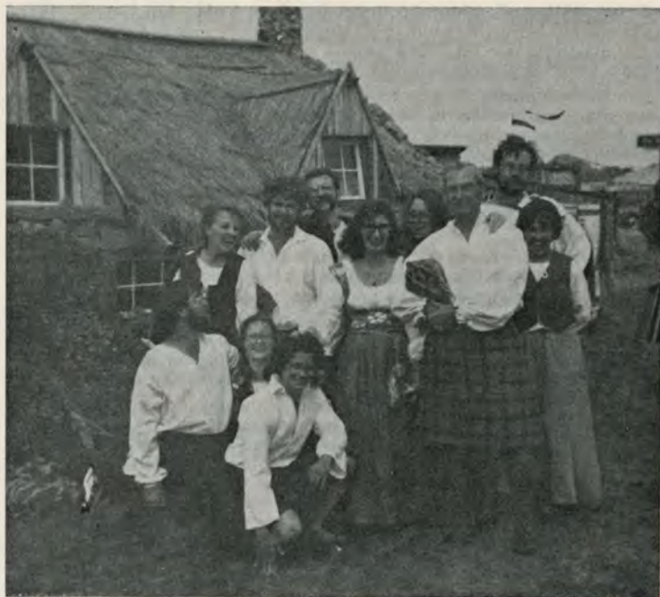
A group of Twin Cities members and friends at the Renaissance Fair

party. Other social events are the monthly parties and the January Burns Supper. It is hoped to dance again in Stanley Park during June, July and August, when all visitors will be welcome.