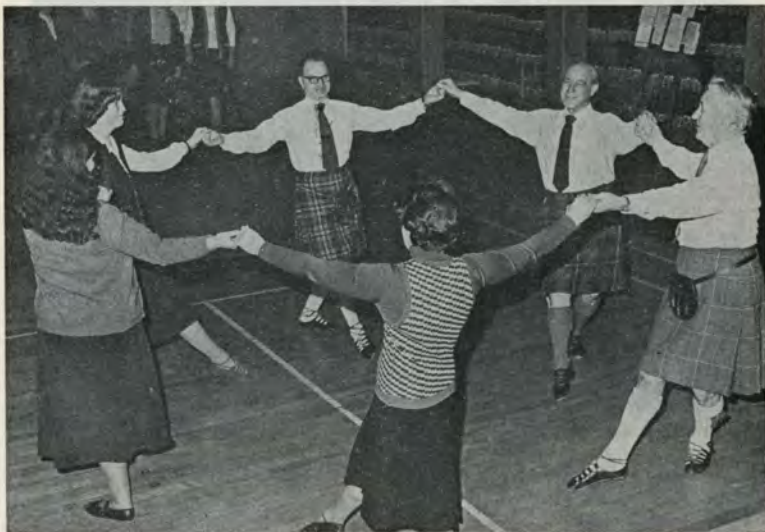
Gatehouse-of-Fleet Branch Class in action