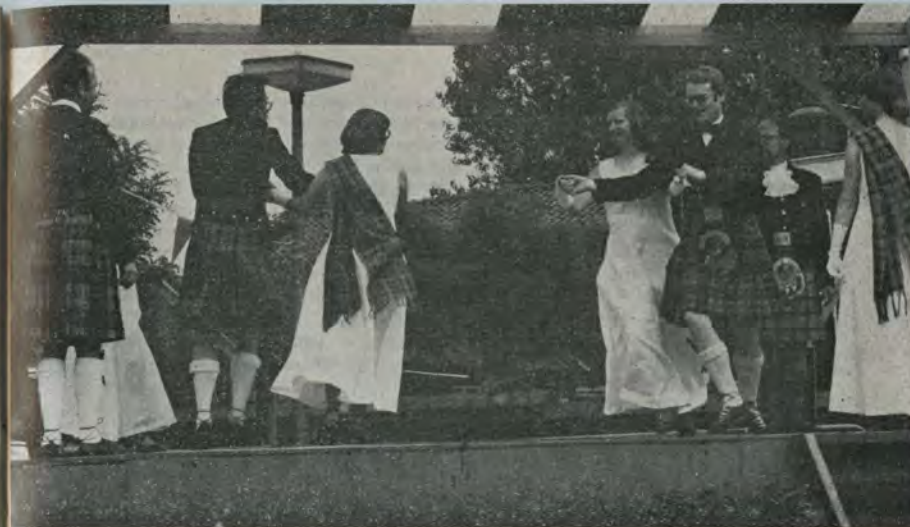
The Hague District Branch Demonstration Team at Zoetermeer