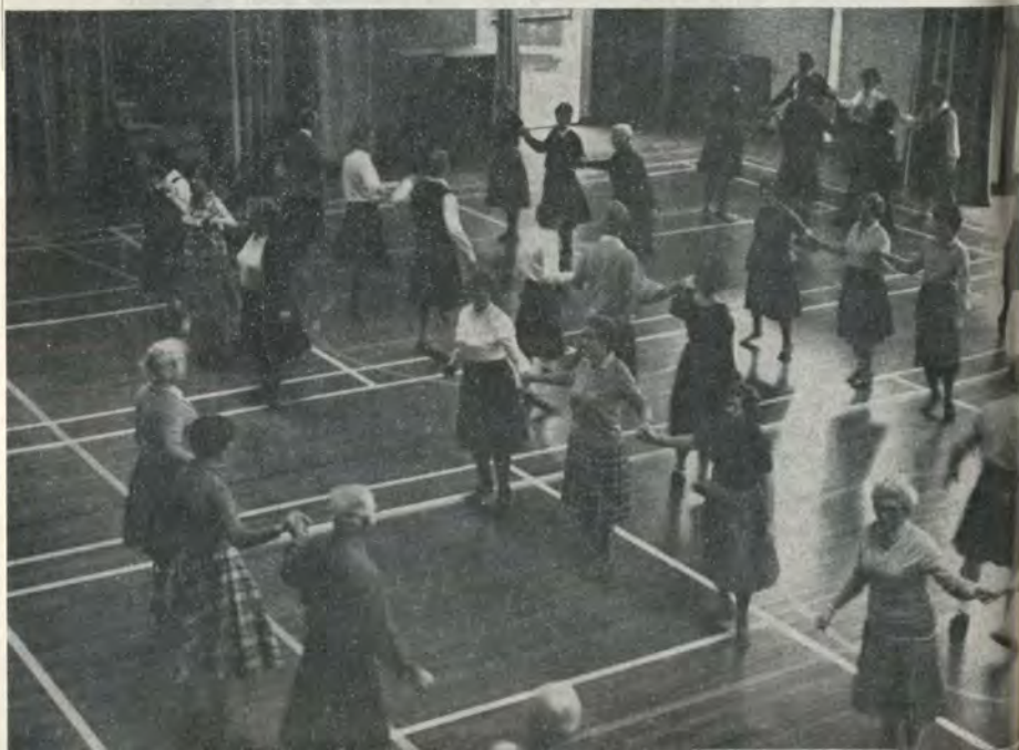
Cheltenham Branch Weekend School, February, 1982

Clackmannanshire. Membership: 47 Annual, 7 Long Term, 12 Life. Classes per week: 2.