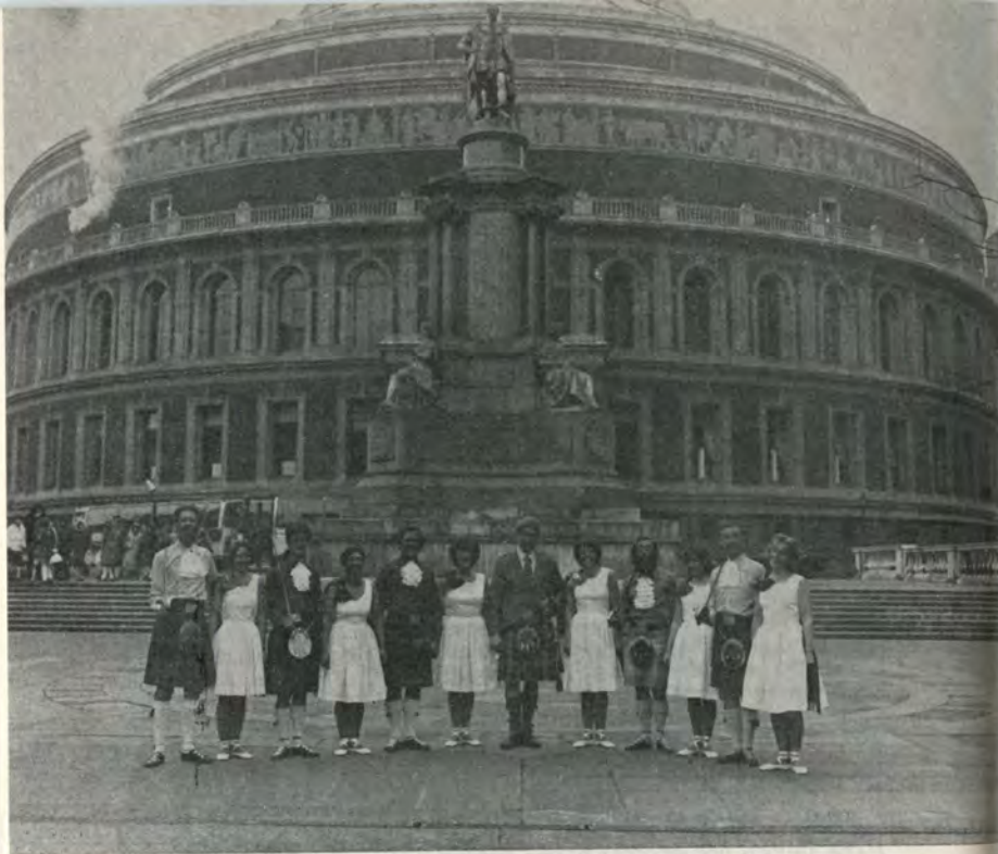
Bath Branch Demonstration Team assembled at the Royal Albert Hall, February, 1982

Bath. Membership: 110 Annual, 14 Life. Classes per week: 3 Adult, 1 Junior. Demonstration Team available.