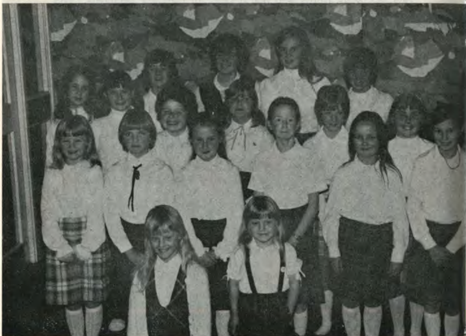
Junior Associates of Southport Branch at the 24th Annual Festival in the Floral Hall

The 24th Annual Festival held in November was most successful with excellent support from teams travelling from many parts of the country together with the Maple Leaf Band from Dundee. On 13th November, 1982, the Branch celebrate their 25th Annual Festival, Floral Hall, Southport, with a display at 2.30 p.m. and a Ball at 7.15 p.m., dancing to the Maple Leaf Band.