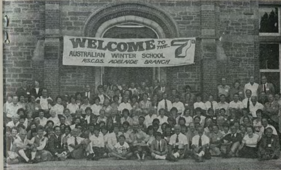
The Seventh Australian Winter School

The year has been quite a successful one for the Branch. Membership has increased and there have been good attendances at the weekly classes throughout the year. It has been a particularly busy year as the Branch were hosts to the Seventh Australian Winter School which was held at Roseworthy Agricultural College from 15th to 22nd May, 1982. 157 dancers from all over Australia and also from New Zealand attended the School which proved to be a successful and happy event.