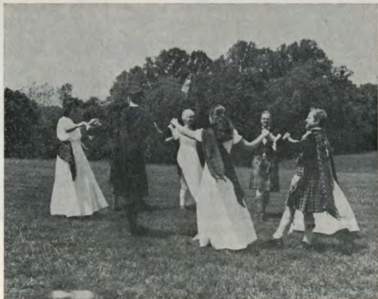
Delaware Valley Branch Demonstration Team, August, 1982