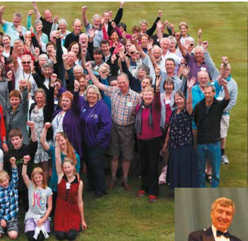
AGM delegates, young dancers in Colorado, leading back up an, and Chairman Elect with the Provost of Perth and Kinross, and the Provost's Band at the AGM in Perth.