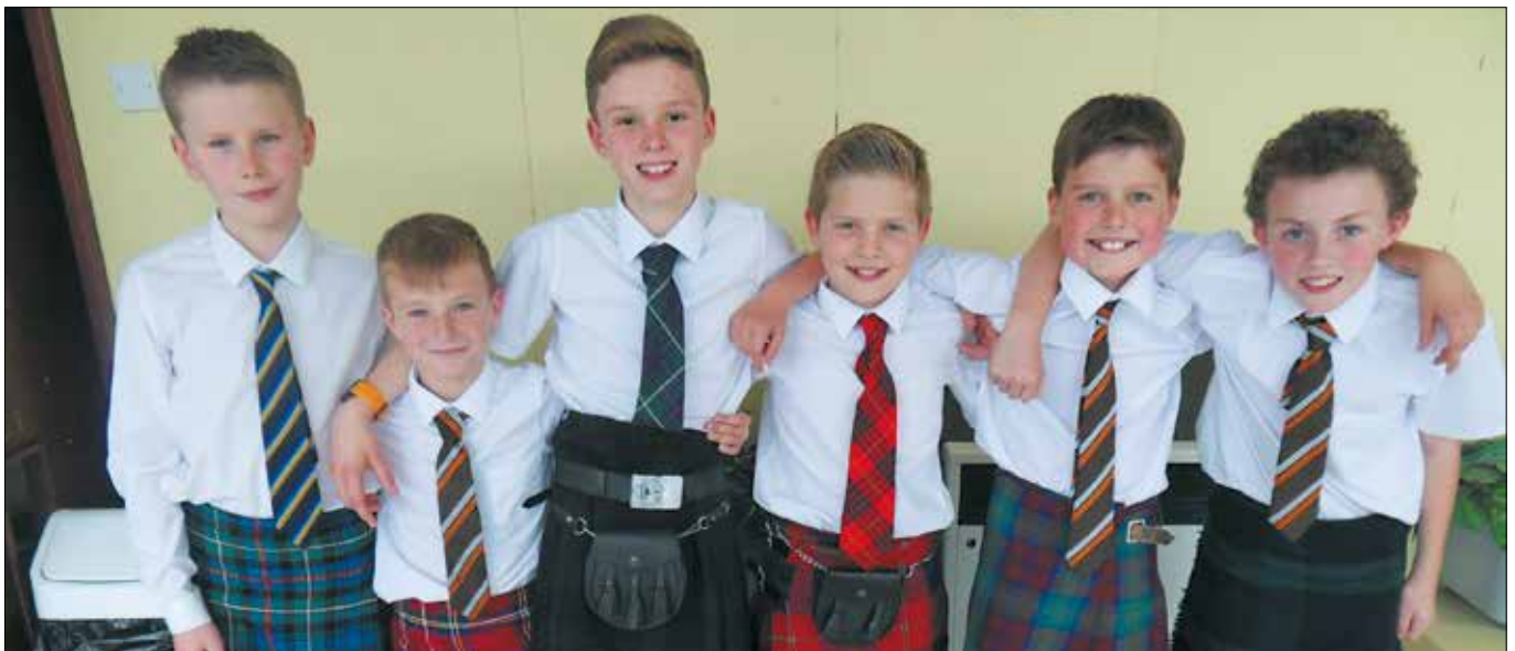
Six Scotsmen in kilts!