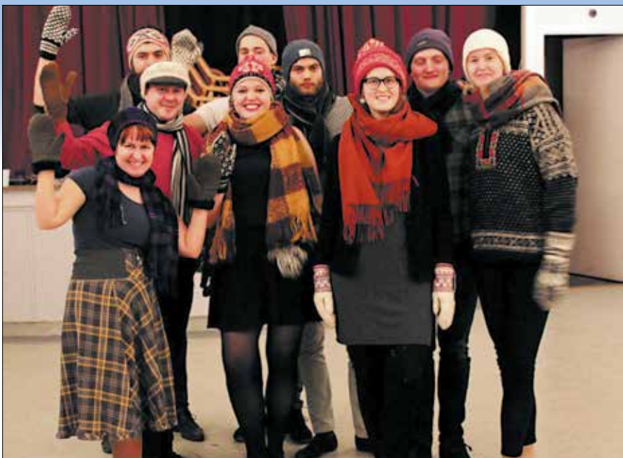
Oslo dancers dressed for January!