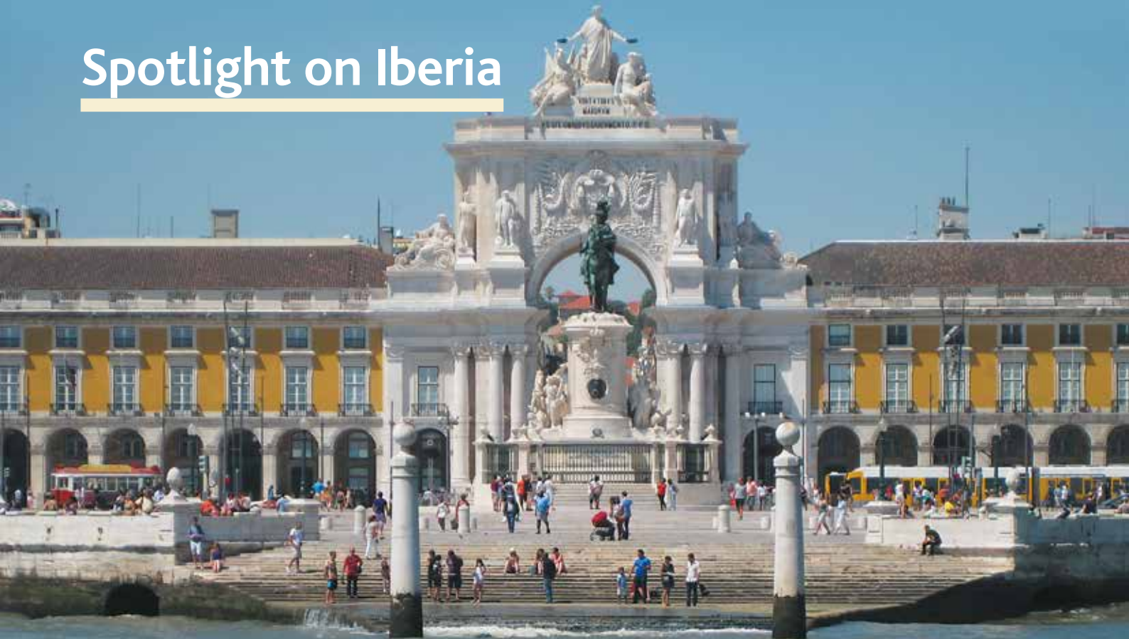
Lisbon with three country dance groups.

We have no branches in Spain or Portugal, but there are thriving country dance groups for you to call in on next time you are looking for some sunshine. Portugal has four groups, one in the Algarve and three in the Lisbon area. Spain has at least six groups. For all contact details, see sites.google.com/site/ipscdg/ Every year all the groups come together for the Iberian Weekend. All the groups welcome visitors, so pack your pumps along with your passport!