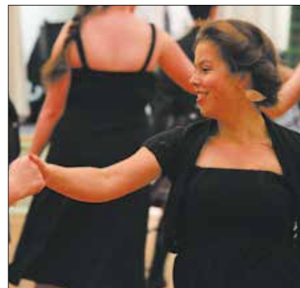
SUSCDF Ball, Edinburgh