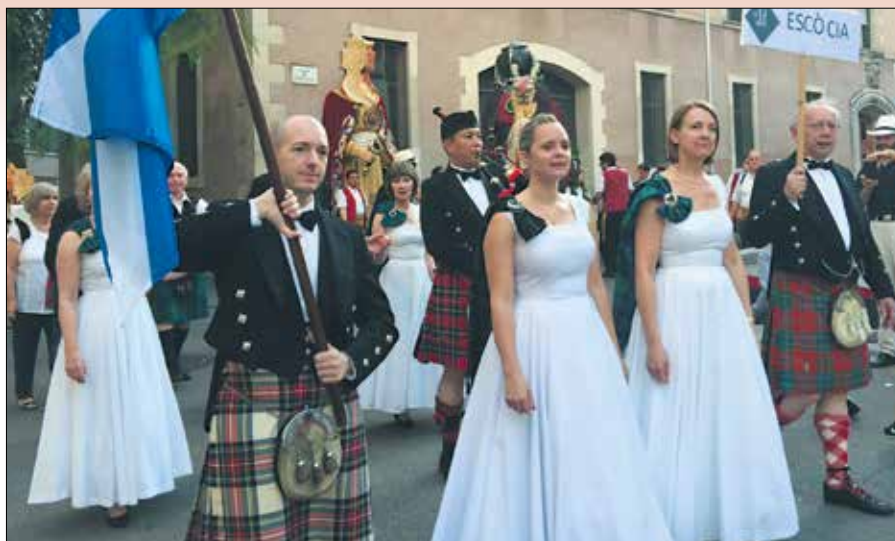
Edinburgh Branch on parade!