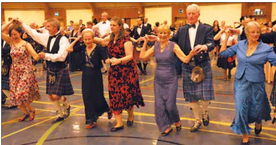
Dancing The Library of Birmingham at the AGM