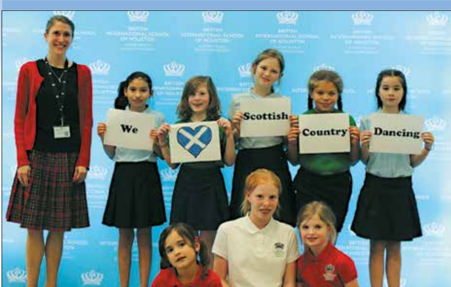
Young dancers from Houston and District Branch

The Youth Services Committee spent months preparing Global Youth Week, trying to involve as many people as possible. Setting a date was never easy. January is a great month for the Northern Hemisphere, but on the other side of the world, dancing hasn't started.