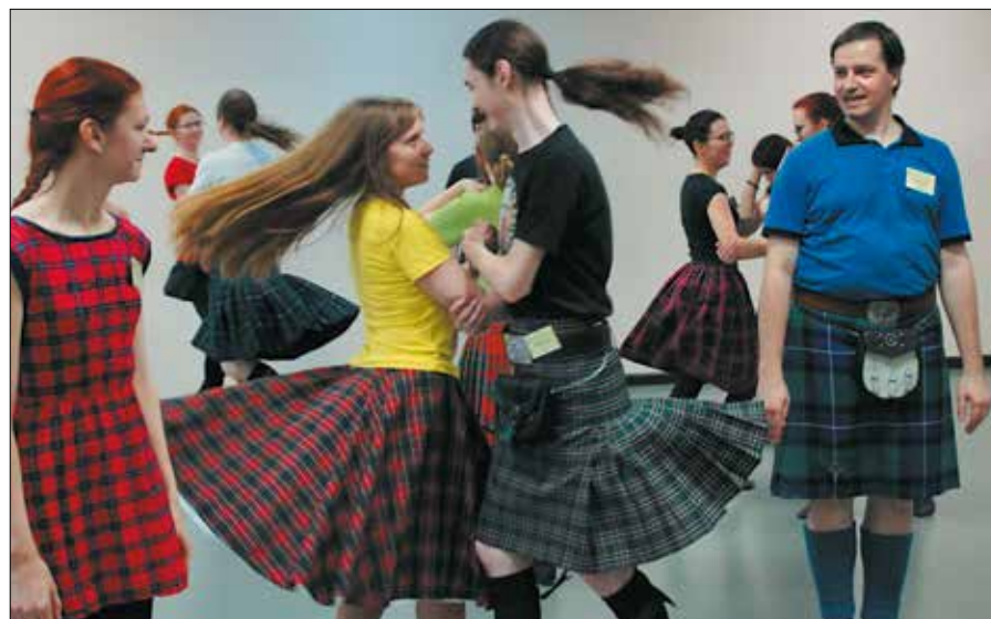
Birling in Russia