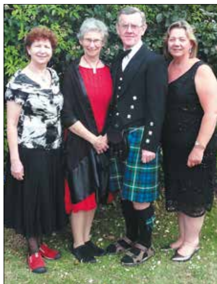
Australian members at New Zealand Summer School

Queensland Branch has plans in July to repeat last year's successful weekend at Caloundra on the Sunshine Coast.