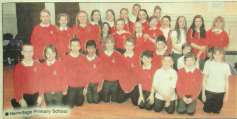
■ Hermitage Primary School