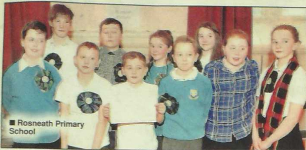
■ Rosneath Primary School