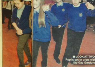
LOOK AT TWO: Pupils get to grips with the Gay Gordons