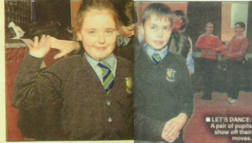
LET'S DANCE: A pair of pupils show off their moves.

For further information on local Scottish Country Dance opportunities visit the local branch website www.mcds-helensburgh.org.uk for information contact details.