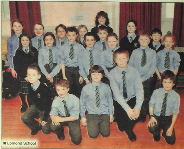
■ Lomond School