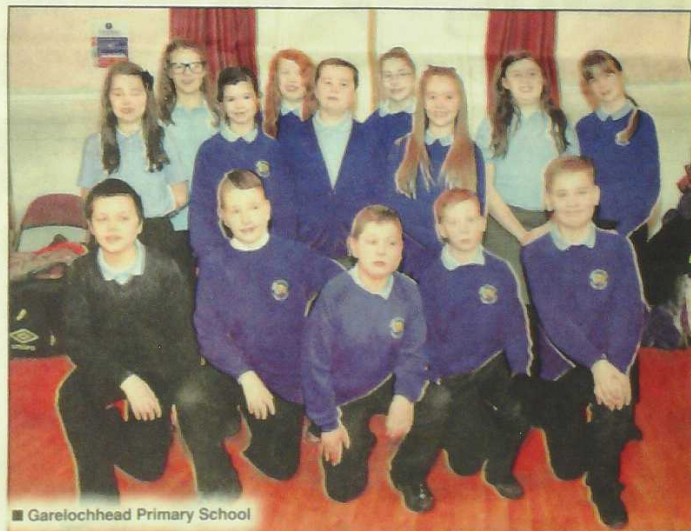
■ Garelochhead Primary School