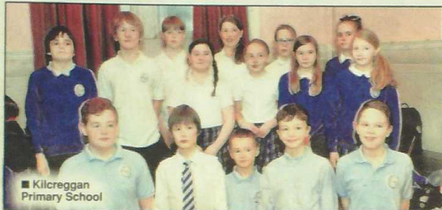
■ Kilcreggan Primary School