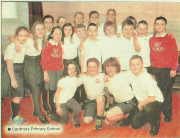
■ Cardross Primary School