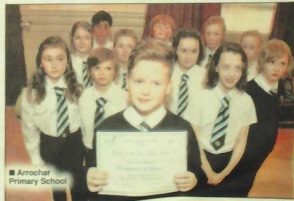
■ Arrochar Primary School