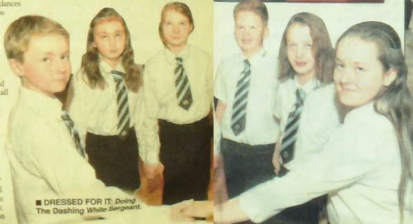
DRESSED FOR IT: Doing The Dashing White Sergeant.